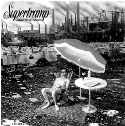
LP cover Supertramp, Crisis? What Crisis? , 1975