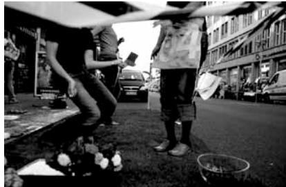
Park(ing) Day: PARKground to PARK!

Parks can be a secular paradise. Traditional gardening or land art, for leisure or play, whether Alhambra or Babylon, Park Fiction